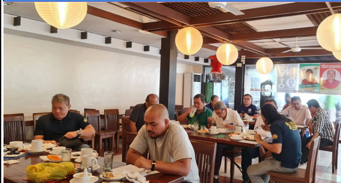
Breakfast meeting and Fellowship