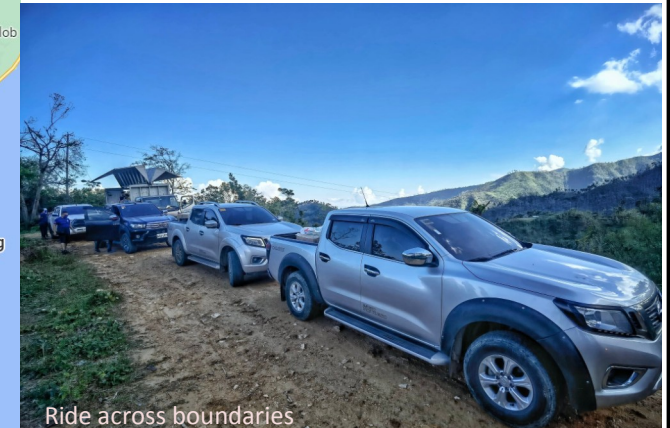
Ride across boundaries

ASSEMBLY PLACE: PETRON GAS STATION Airport, Sibulan ASSEMBLY TIME: 7:30am then TAKE OFF BRUNCH(10:30): Tanawan Coffee Shop Ayungon, Neg. Or. HEAD HOME: via Mabato-BanBan- Mabinay-Bais-Dgte. ASSESSMENT: TBD